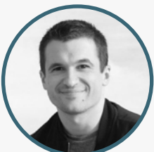
Alistair Webster Communications